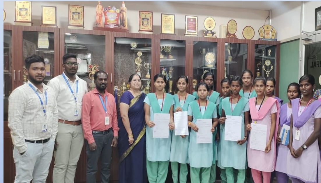
Blue Ocean Company- Campus Interview