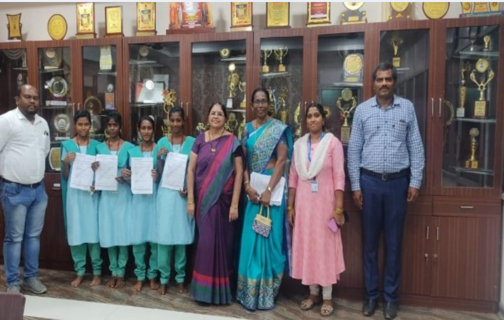
rising Star Company- Campus Interview